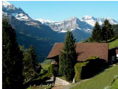
View of the chalet la Bergerie in spring

A magnificent home totalling over 350 sq. meters, this fully furnished chalet includes an upper salon with grand piano, premium stereo equipment, satellite TV and large fire-place. An entertainment room as well as a formal dining room and an Internet corner are located on the ground floor. The house also includes 5 double bedrooms, 3 bathrooms and an eat-in kitchen. For the winter season 2010-2011 a sauna and a rest room will also be available.