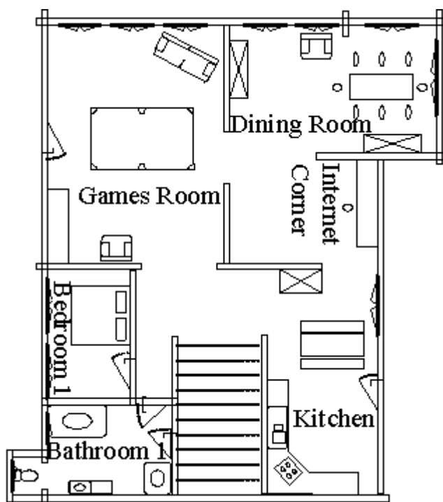
Map of the ground floor